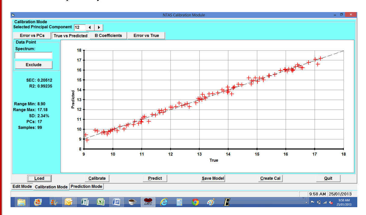
Figure 2. Calibration Plot for Protein